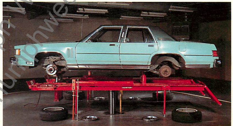
Model D2 Lift Rack

Hunter offers a complete line of racks, wheel stands and pits to fit any bay and accommodate nearly every size vehicle. Optional accessories give Hunter racks the ability to perform a multitude of services in addition to wheel alignment.