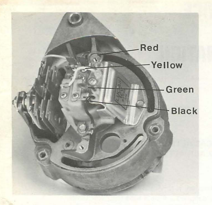
4 lead regulator connected to correct brush box terminals.