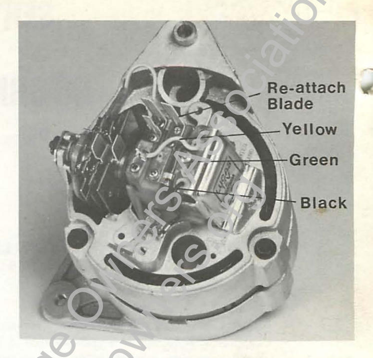
If a 3 lead regulator is substituted for a 4 lead regulator, connect as shown, insuring that the terminal blade the red lead was previously connected to is re-attached.