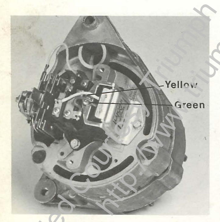
A 2 lead regulator substituted for a 3 or 4 lead regulator. Insure that regulator casing has good contact to alternator end bracket. Re-attach blade.